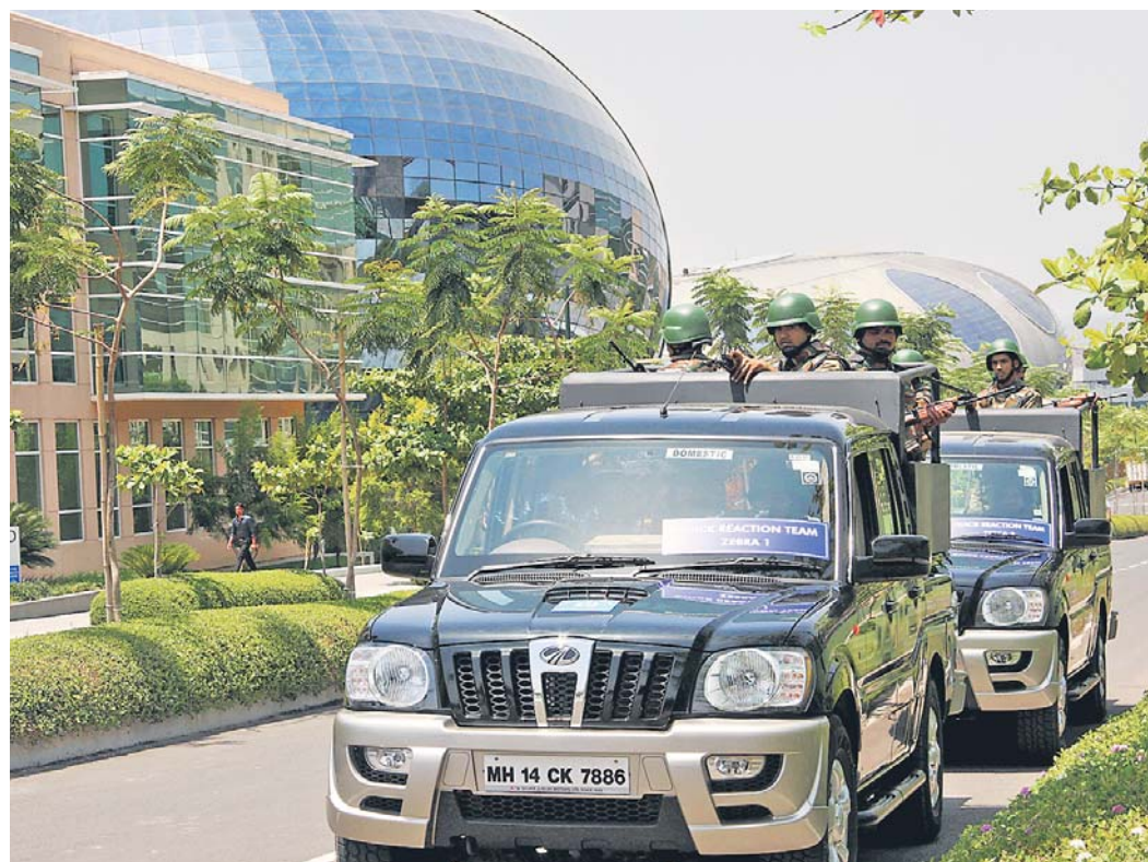
The Central Industrial Security Force's quick response teams put on a show of strength on the Infosys campus at Hinjewadi on Thursday