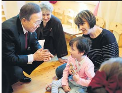
UN secretary-general Ban Ki-moon at a rehabilitation centre in Moscow on Thursday