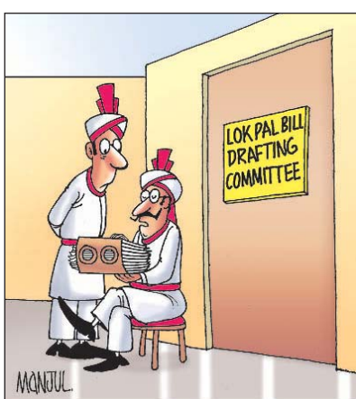
No, it is not the draft. These are the latest controversies related to the co-chairman.